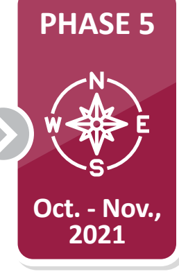
Final Master Plan