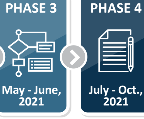
Draft Master Plan