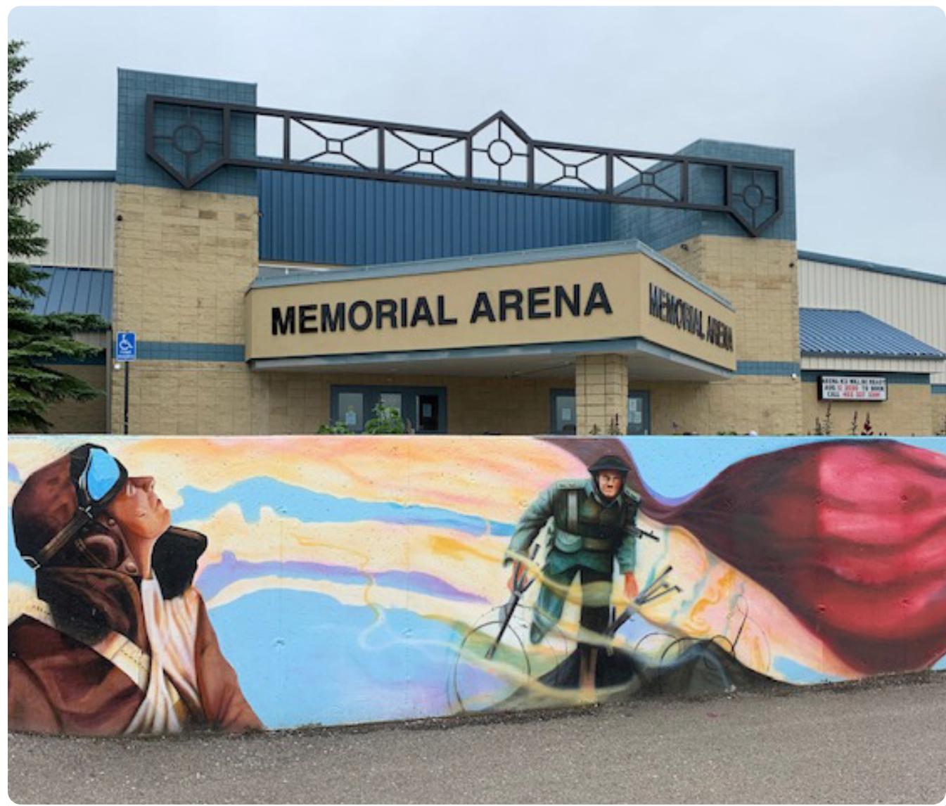
Memorial Arena