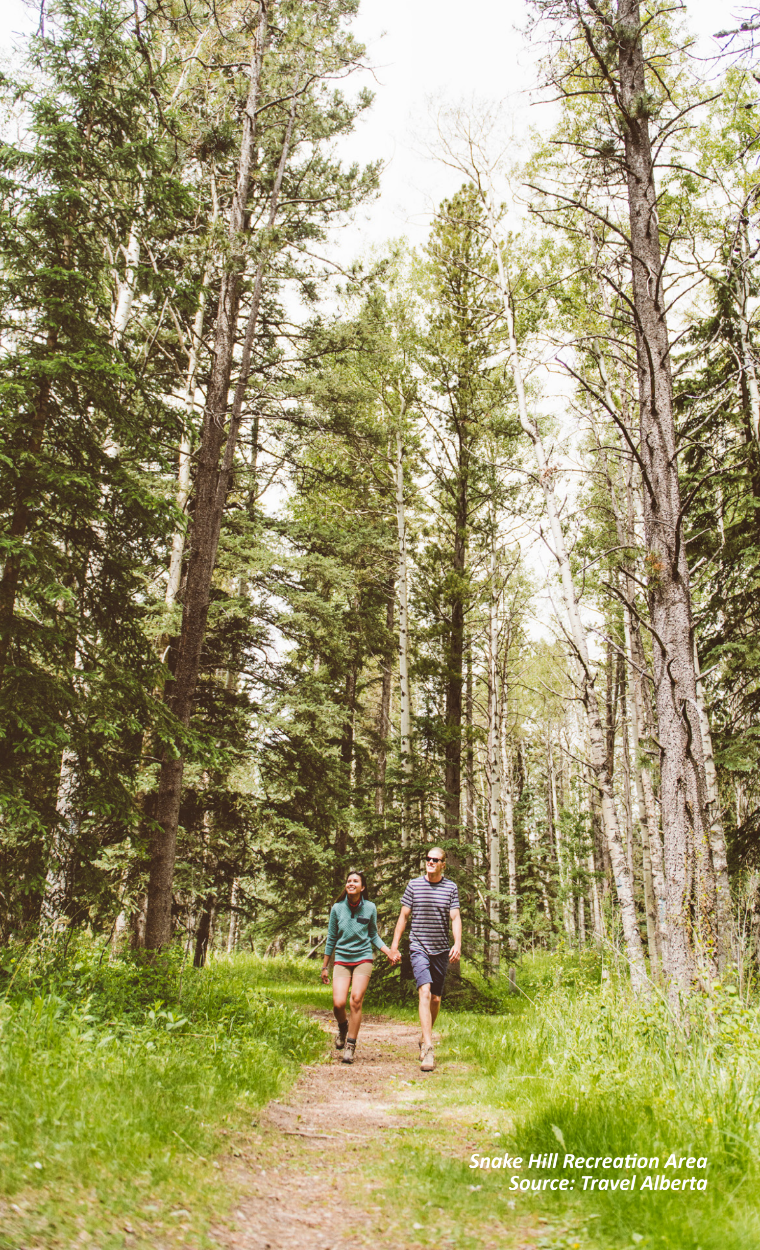
Snake Hill Recreation Area