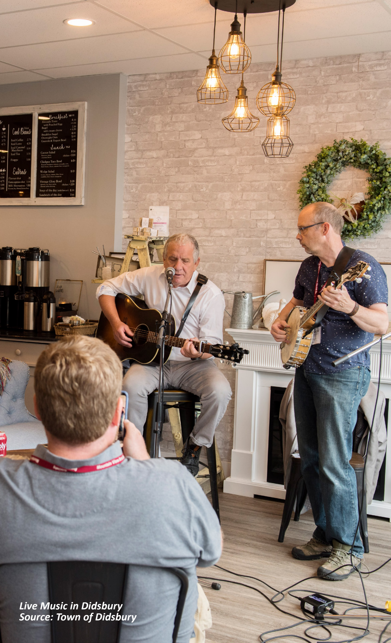
Live Music in Didsbury