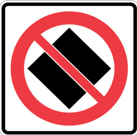
60 x 60 cm

The signs shall be reflectorized or illuminated to show the same color and shape by night or by day.